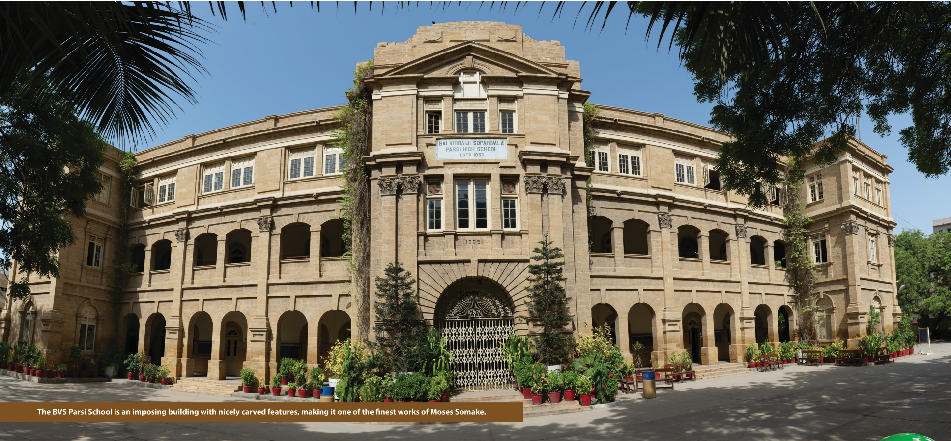
The BVS Parsi School is an imposing building with nicely carved features, making it one of the finest works of Moses Somake.