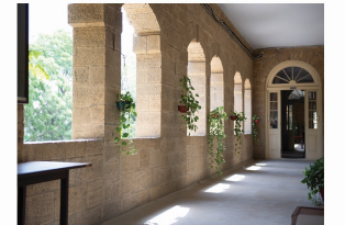
The building has semi-circular openings at the ground floor and segmented ones on the first floor.