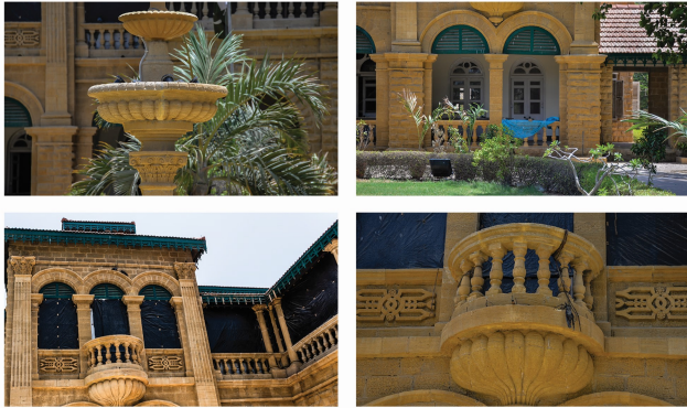
The bungalow also includes servant quarters and a horse barn which is now converted into a hall for guests.