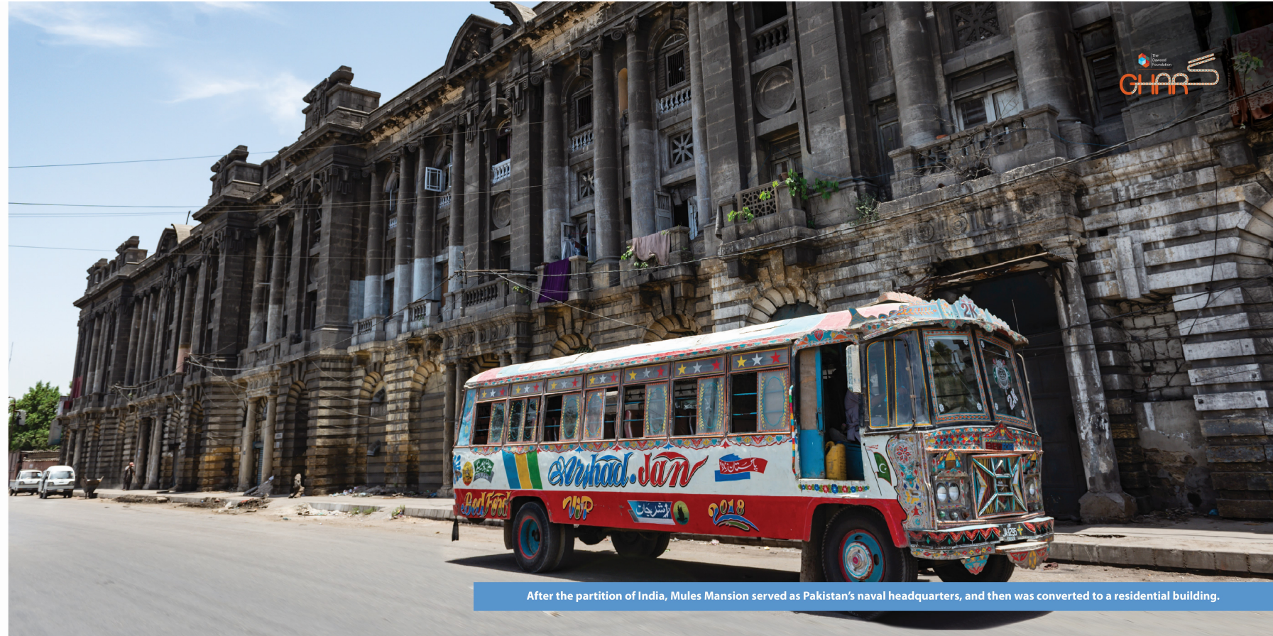
After the partition of India, Mules Mansion served as Pakistan's naval headquarters, and then was converted to a residential building.