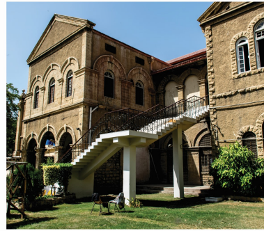
During World War II, the KGA Hall was used as the Senior Officers Club for a short period but was restored back to its former use.