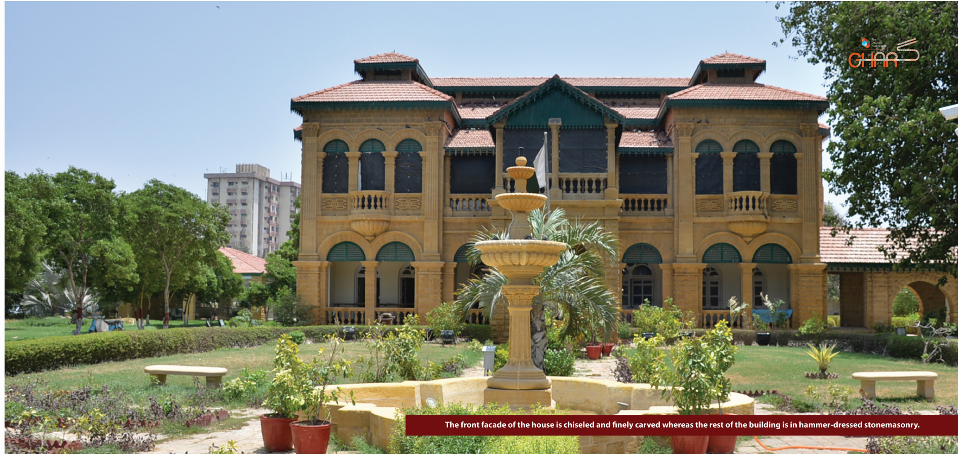
The front facade of the house is chiseled and finely carved whereas the rest of the building is in hammer-dressed stonemasonry.