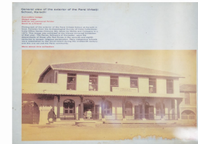
In 1923, an extra storey was built and added using the same Girzi stones to match the stonemasonry of the building.