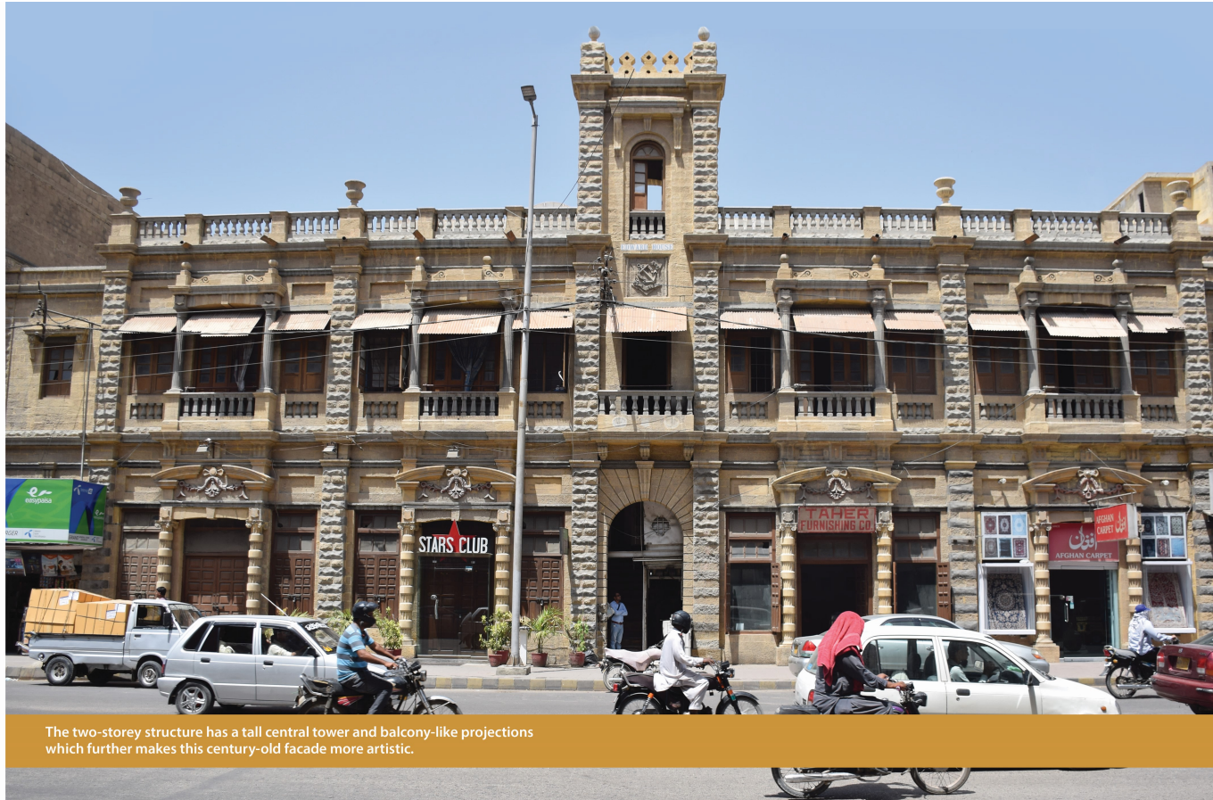
The two-storey structure has a tall central tower and balcony-like projections which further makes this century-old facade more artistic.