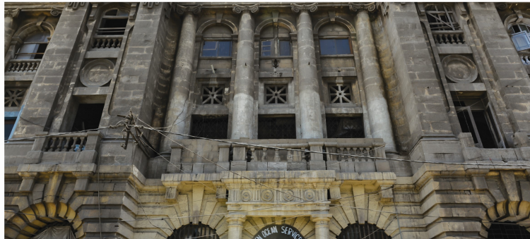
Mules Mansion has an orderly arrangement of columns and the prominent Anglican features that can be readily noticed.

Mules Mansion was built in 1917. It blends Renaissance and Anglo-Oriental methods of architecture in a distinctive style. Mules Mansion had once been the grandest and most recognizable buildings in Karachi. It was built to serve the porters of Karachi Port Trust. The structure is ornate with prominent features like pilasters and vaultings on the roof. Virtually empty except for a few small shops, the building now houses some offices and residencies. Over the time, the exterior of Mules Mansion has been eaten away by pollution and dust.